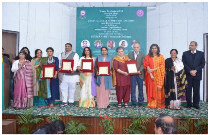
Jijabai Award Ceremony