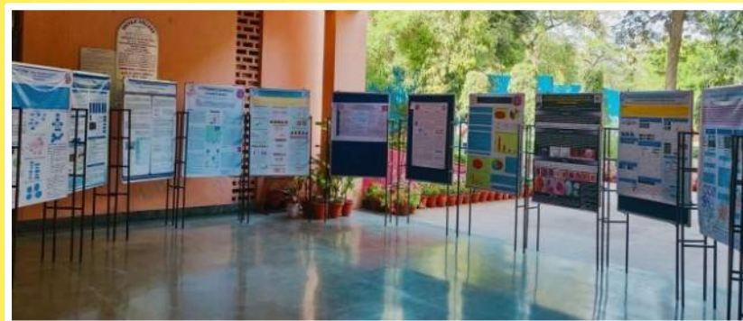
The College Campus Awaits

The third edition of Biochemi , an annual scientific magazine published by the Department of Biochemistry, was also released as a part of this event.