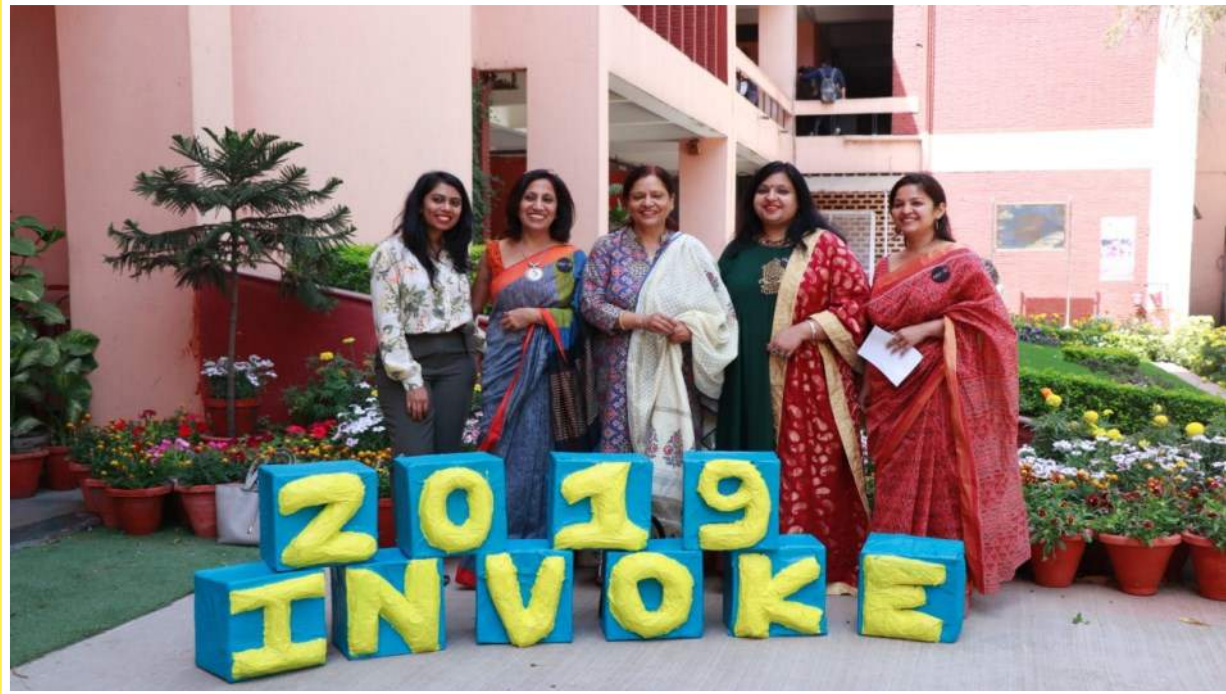
Business Economics Department Fest

Apart from this informative and interactive workshop, a number of fun and frolic events were also organised. “The Decisive Hunch”, “Total Lockdown” and “Gen-ish Quiz 2.0” were a grand success. Furthermore, “Brand-Zoned 2.0”, “Cric-Star”, and “Treasure Hunt” were greatly enjoyed. Stalls with exciting games were also put up across the college. The event was further enhanced by the contribution of our sponsors Monster, NesPlus and Santusht.