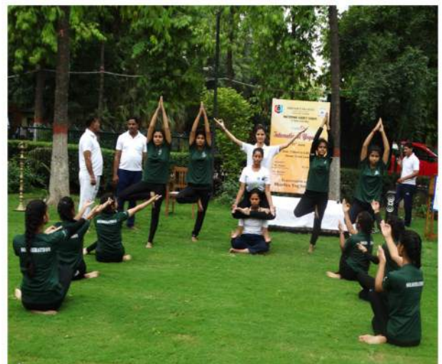
Unity of Mind and Body