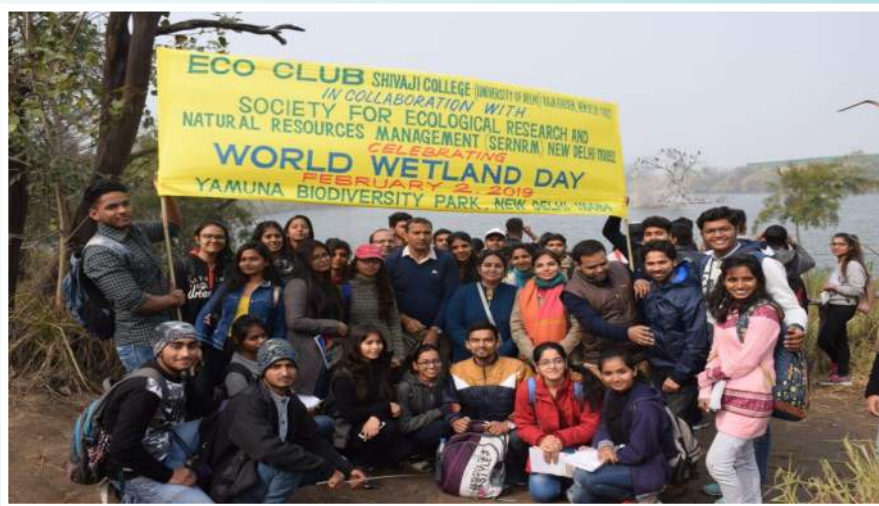
Eco Club Celebrates World Wetland Day