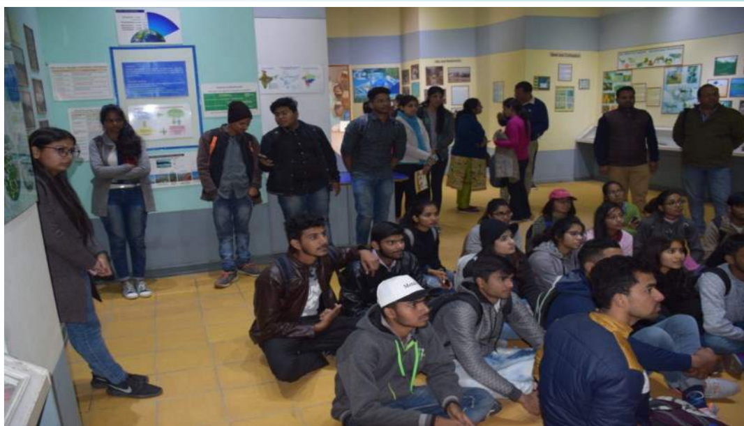
Eco Club Fest Peepal

The Eco-club annual festival Peepal was celebrated on March 29, 2019 in Shivaji College. Eco-club has instituted Dr. Punjabrao Deshmukh Memorial Trophy for “Innovative Green Model: A Solution for Environmental Issues”. The models were evaluated based on practicality, novelty, ability to solve environmental problem, social applicability/usefulness, and cost effectiveness. Inter-college competitions were also organised that included: (i) Environmental Quiz Competition (ii) Elocution Competition Pollution Ka Solution (iii) Best out of Waste and (iv) Perception on Climate Change -- Painting/Sketching/Doodling.