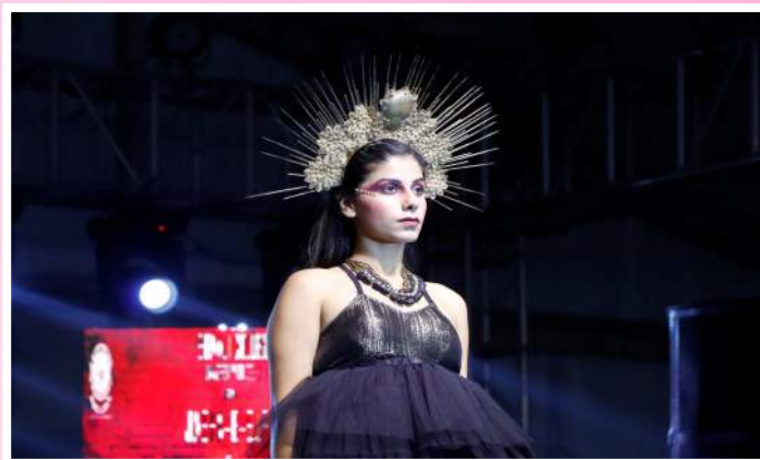
Fashion Show “Panache”