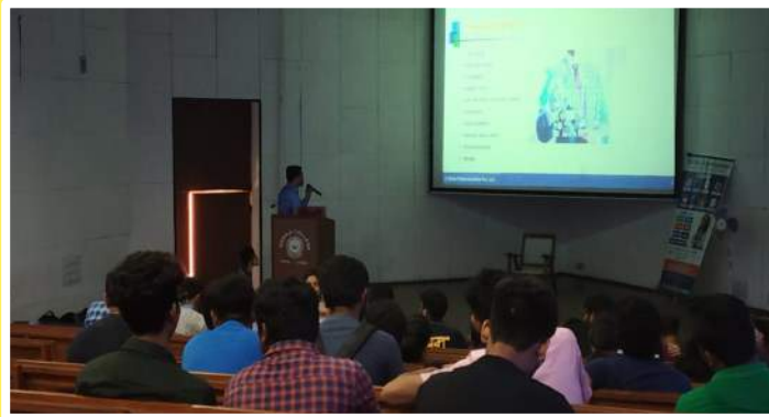
Seminar on “Prospects and Challenges of Overseas Education”

A Seminar on “Prospects and Challenges of Overseas Education” was held on March 25, 2019. The seminar explained the different courses available in the fields of business and economics in various countries such as USA, UK, Australia, Germany etc. along with the duration and cost of these courses and admission requirements. Furthermore, the work avenues and living expenses for many options were also explored. Lastly, test preparation services and consultancy services were also detailed so that students could fully understand the requirements of overseas education and ask further queries.