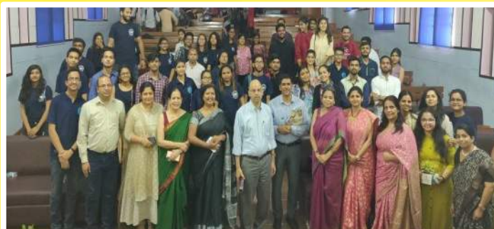
The Shivaji Family Participates