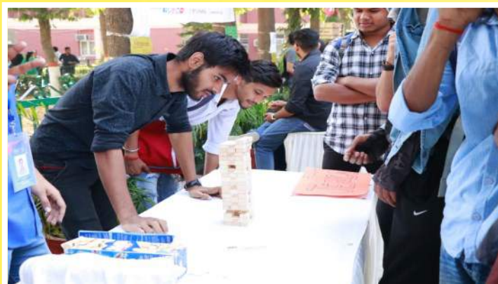
Building Blocks of Success