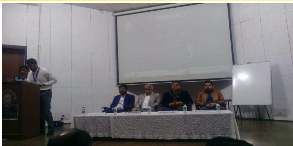
Dignitaries during Inauguration of Infinity