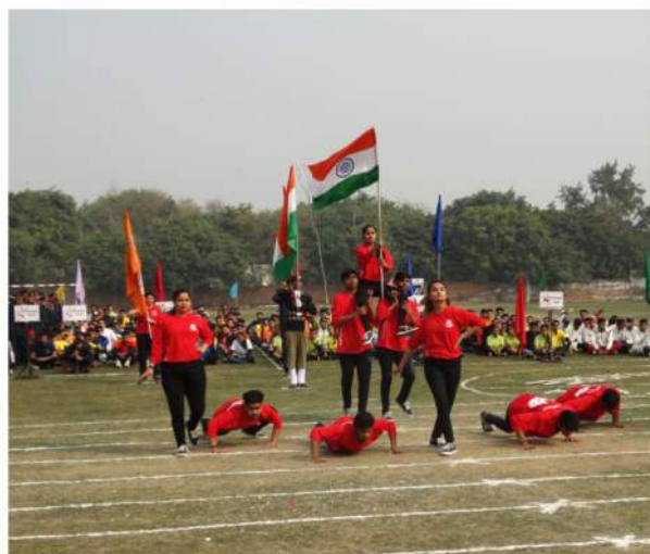
National Flag and Heads held High