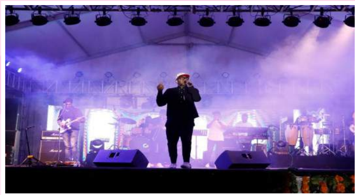
Benny Dayal – Star Night Performance