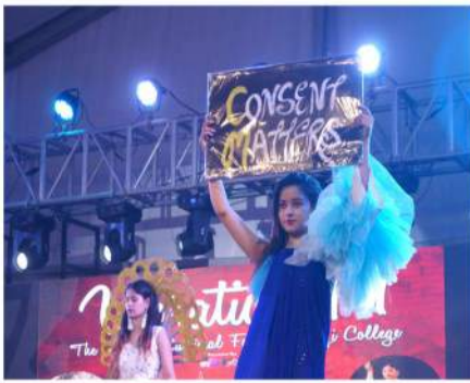
My Voice Matters