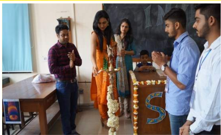
Lighting of the Lamp

On the second day of the Fest, the following competitive events were organised: “Democreative Bhautiki – Expliquer La Physique”, in which students were supposed to showcase their intellect on any self chosen topic of Physics; Rangoli Making Competition “Alpana – Colour Your Idea”; “Skill Mela – Create, Demonstrate, Elaborate”, in which students were required to demonstrate their creativity in Experimental Physics; followed by a presentation; and a quiz competition “Blue Book – Stack Up Your Genius”.