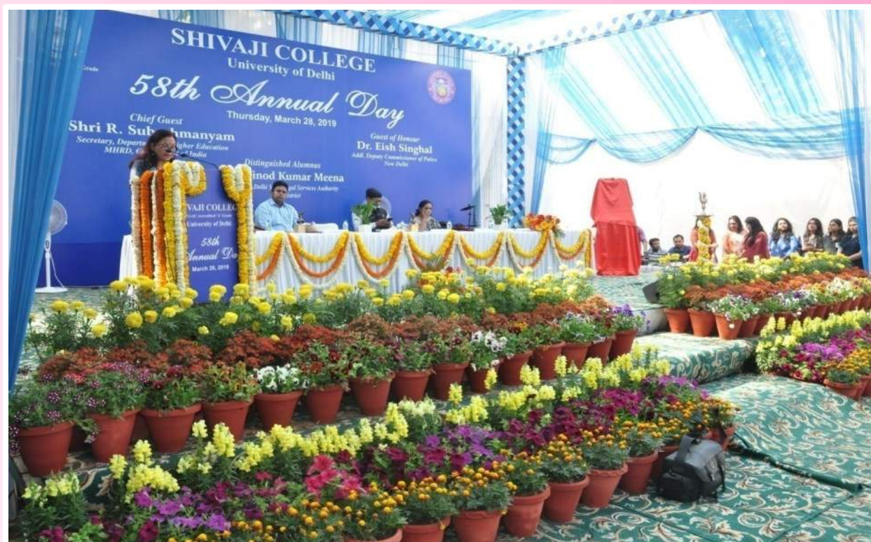
The Principal Commemorates the Momentous Occasion