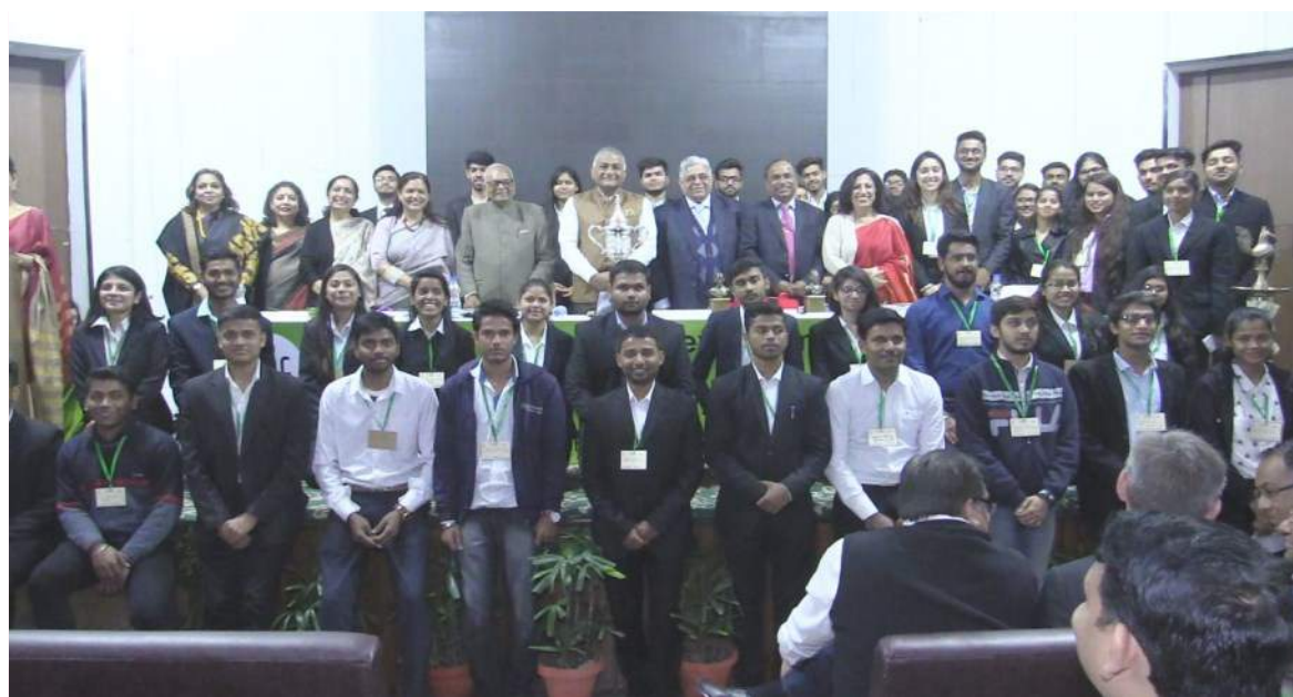
International E-Summit – EDC