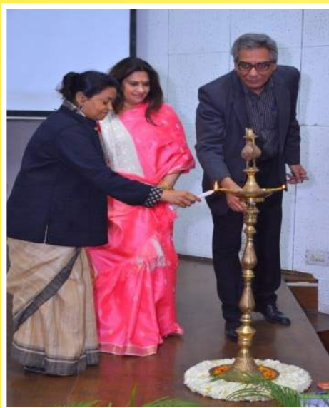
National Seminar on Dynamics of Language in History