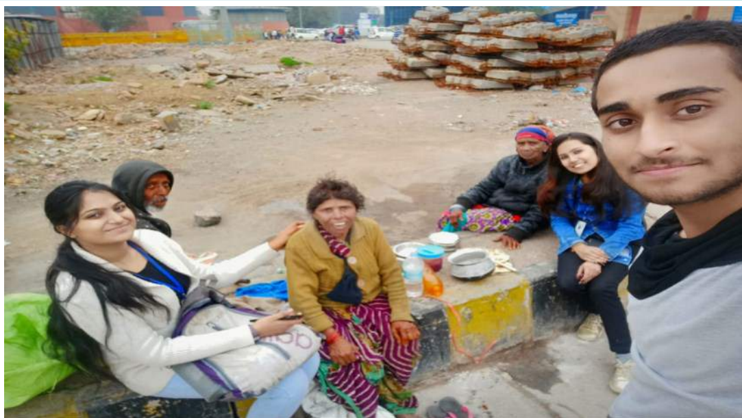
Just Being There: At The Rainbasera

“Power Composting Project” was organised on April 12, 2019. NSS volunteers gathered around the Automated Composting Facility in college. With the diversity of biodegradable wastes ranging from sugarcane chaff to a half-eaten birthday cake, the volunteers undertook a trial activity on the possibility of turning the facility into a self-sufficient entrepreneurial unit. Officials from Alfa-Therm, manufacturers of the facility, briefed the dedicated volunteer on how the machine works and how one can use it to generate 5-7 kg of rich manure on a daily basis. Shivaji College celebrated the International Day of Yoga on June 21, 2019. The 516 cadets of NCC Girls' Wing, which come under the 7 Delhi Girls' Battalion of Shivaji College, Shyama Prasad Mukherjee College, Laxmibai College and, Rajdhani College, performed a spectacular display of various postures of yoga for about an hour. This program was conducted by Yoga experts from the Indian Institute of Yoga, headed by Mr. T.N. Malhotra.