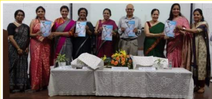
Release of Biochemistry publication Biochemi