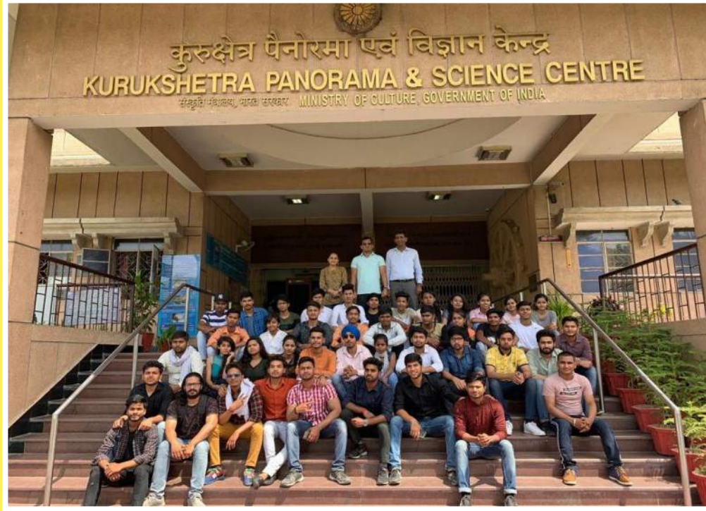
Educational Trip: Department of Sanskrit

An academic tour was organised by the Department of Sanskrit based on Shrimad Bhagavad Gita on April 1, 2019. The students visited the Kurukshetra Panorama and Science Centre at Dharohar, Haryana Culture Museum.