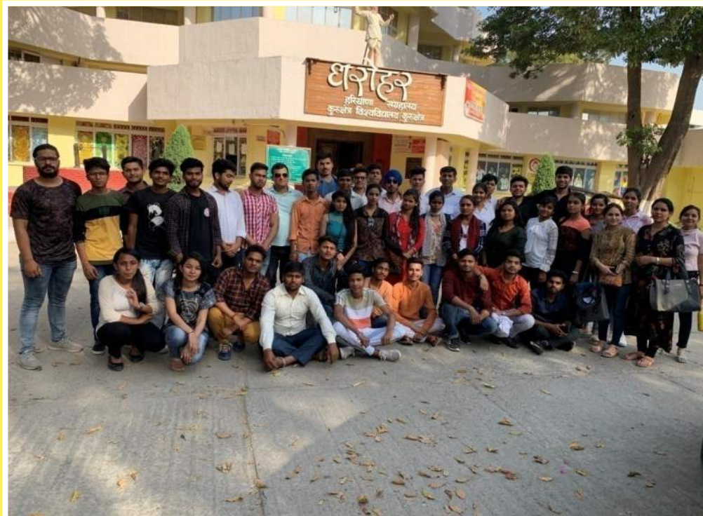
At Dharohar, Haryana Cultural Museum