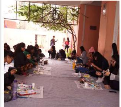
Creativity Abounds in College Halls