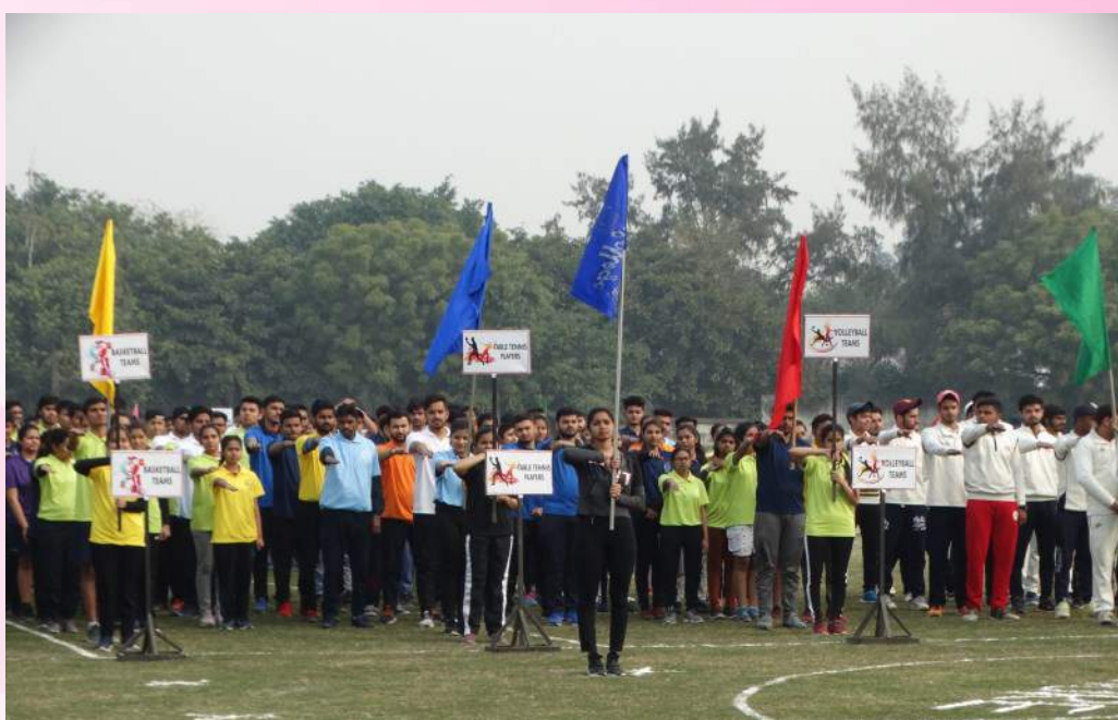
The Teams Stand Together