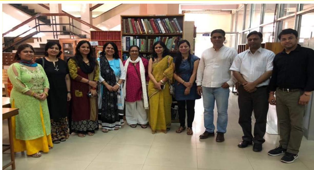
Teacher’s Enrichment Workshop: Department of Mathematics

Teacher’s Enrichment Workshop on “Algebra and its Applications” under the aegis of National Centre for Mathematics, Joint Centre of IIT Bombay and TIFR, Mumbai, was held from 6-11 May 2019.