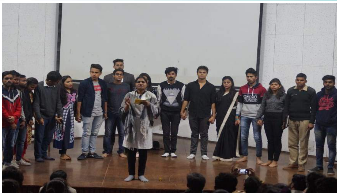
Art and Theatre – NSS

Another event during the fest was the “NSS Summit 2019”, an inter-college, inter-NSS unit panel discussion. Student representatives from different colleges sat together in a self-evaluation mode, and analysed the actual impact of the varied volunteering activities on society and discussed the reasons behind NSS’ languorous volunteer force.