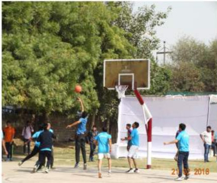
Annual Sports Day