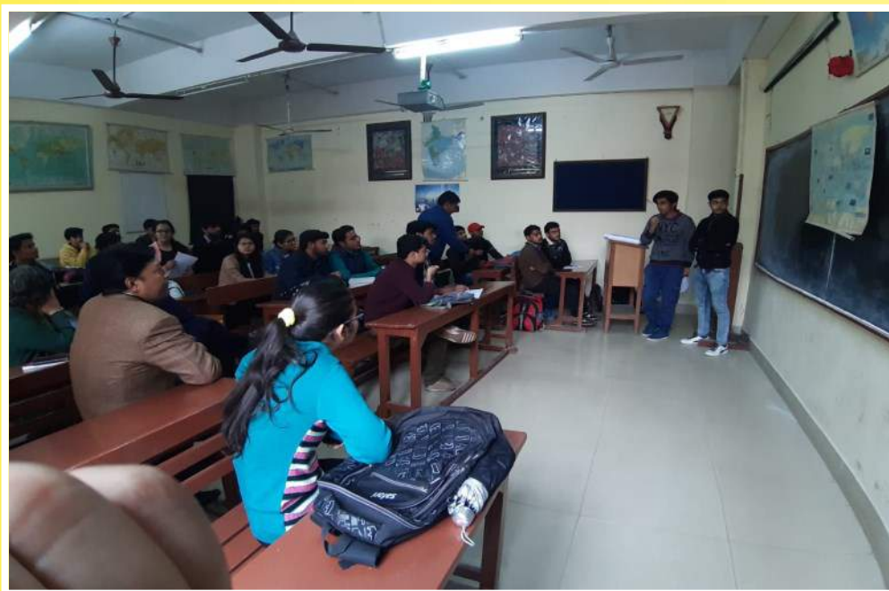
Map Pointer Competition

Under the local academic excursion, the department visited Damdama Lake, Gurugram, Haryana, on February 6, 2019. On February 12, 2019, a one-day local excursion for 3rd Year students was conducted to Manaoli Toki village of Sonapat district, Haryana, as part of their project-based course on Disaster Management.