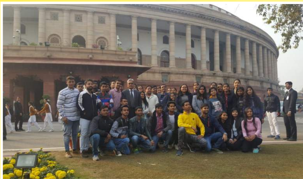
Visit to the Parliament

A 75-member team of students and faculty members (71 students and 4 faculty members) of the Department of Political Science paid a visit to the Parliament of India on January 7, 2019 as part of their educational tour. Dr. Virender Kumar, Minister of State, Ministry of Women and Child Development and Ministry of Minority Affairs, Government of India, New Delhi facilitated the official formalities for the tour.