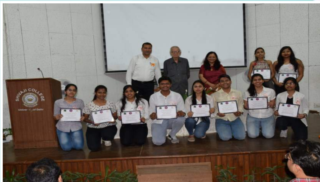
Flying High: Competition Prize-winners