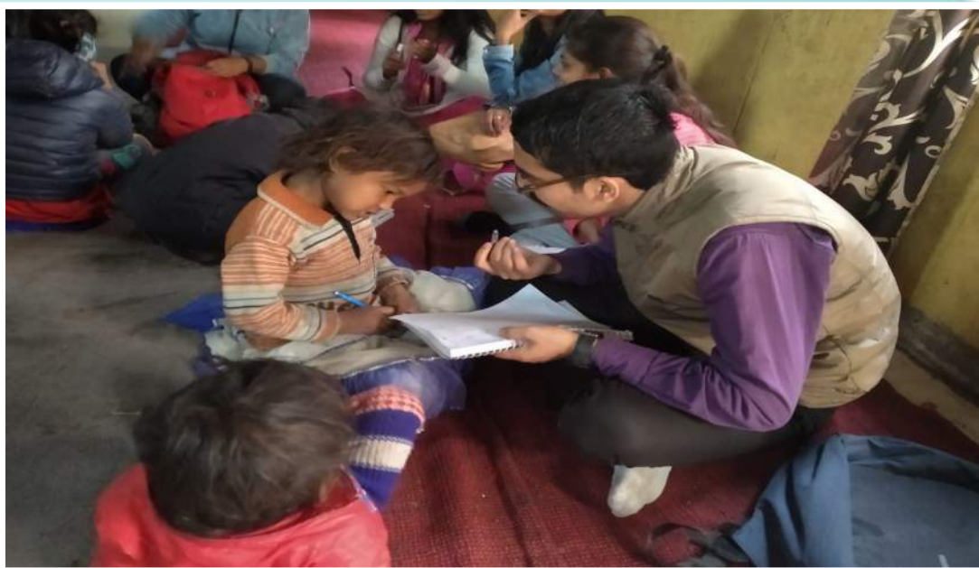
Educating Children at the Rainbasera