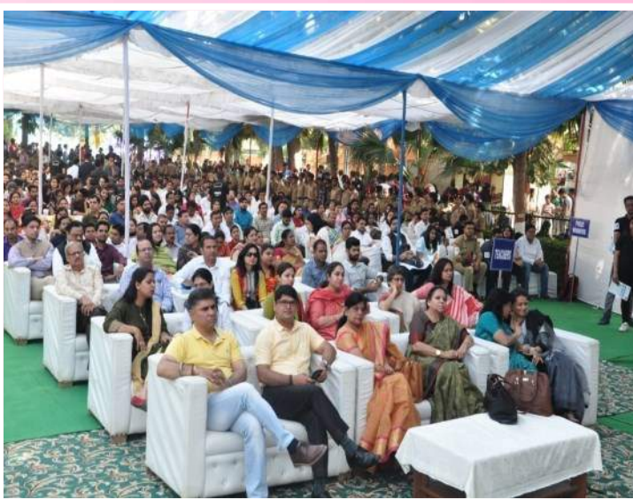
Shivaji College Fraternity on Annual Day