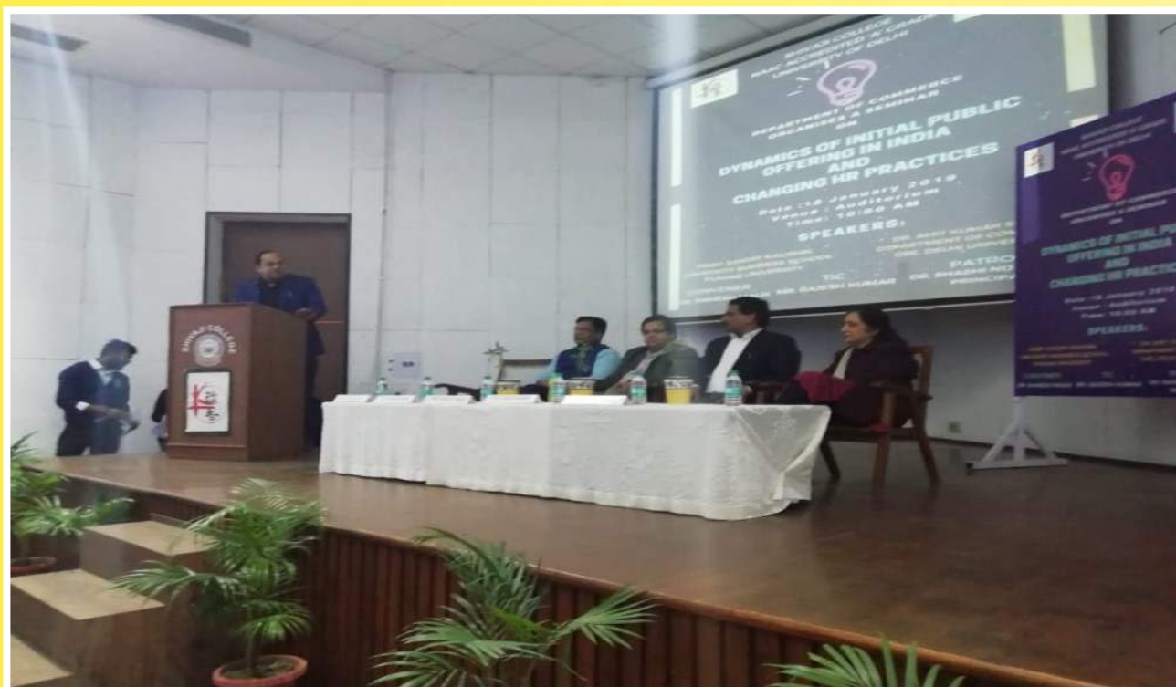
International Seminar: Department of Commerce