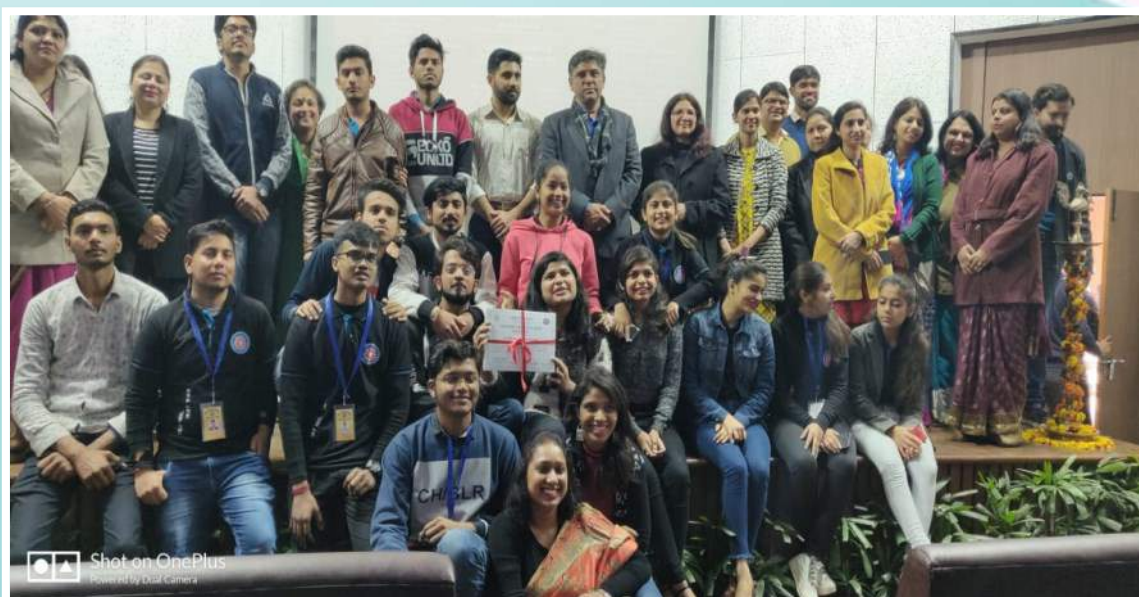
Happy NSS Volunteers