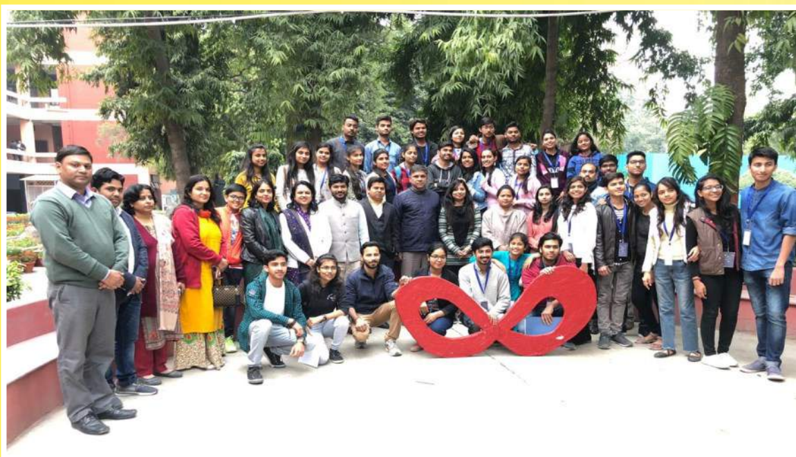
Group Photo of Infinity 2019