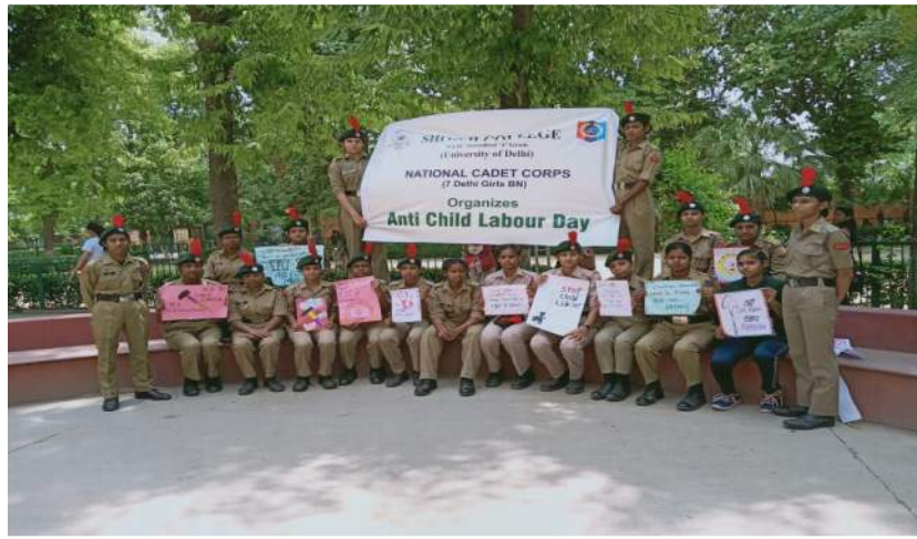
In Honour of Anti Child Labour Day

The NCC (Girls Wing) organised an event in honour of Anti Child Labour Day on June 12, 2019.