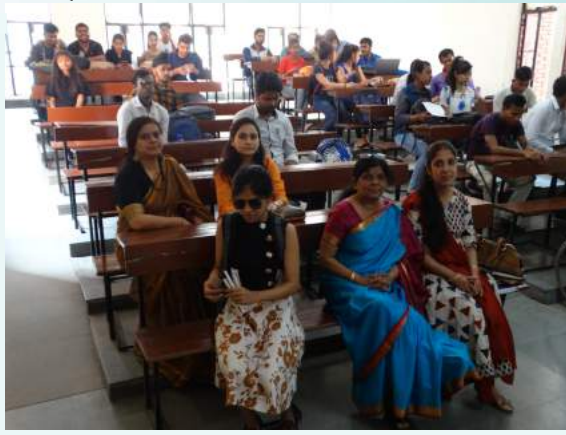
Student Activities: EOC