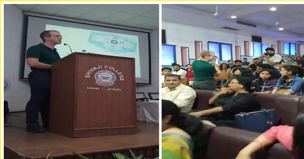
Discussions in the Auditorium