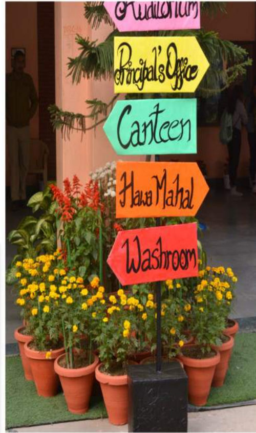
Finding your way begins here