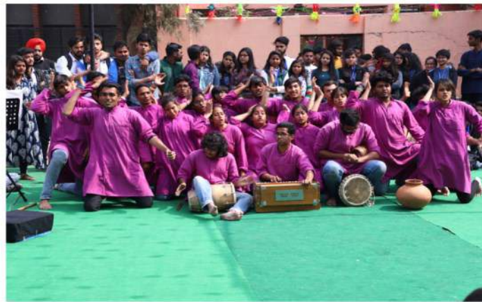
Performing for Change