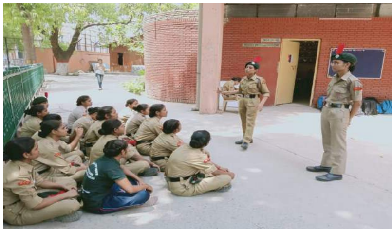
Young Women Cadets in Discussion