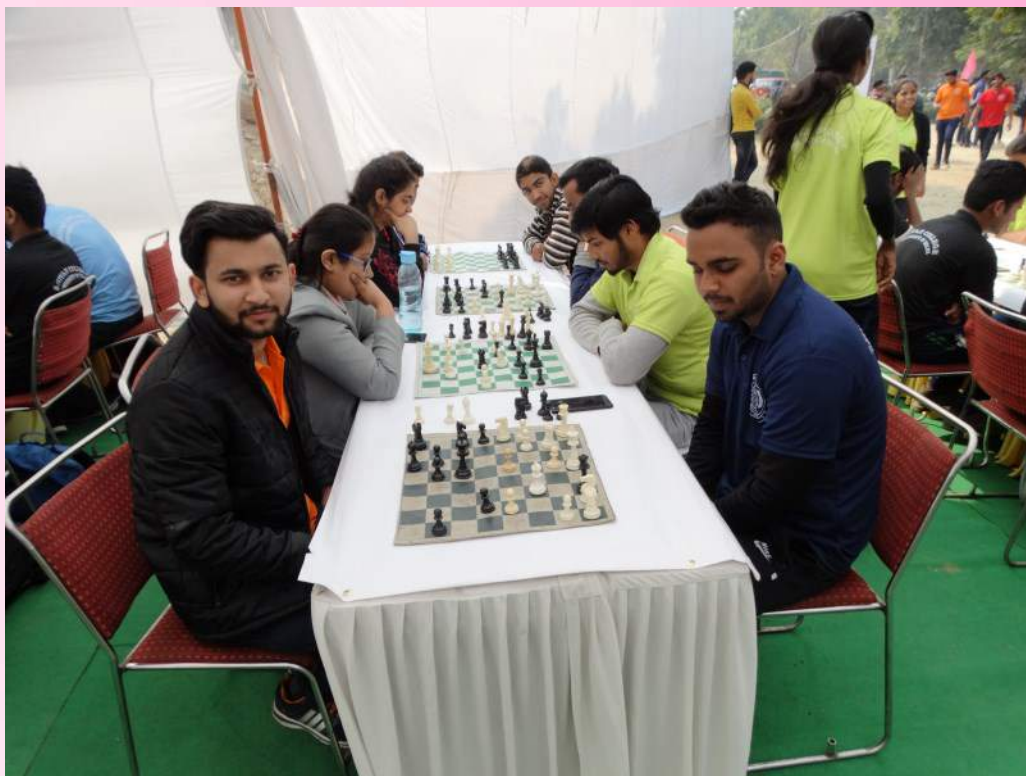
Knights of the Square Table: Chess Tournament

Sports Day was held on February 1, 2019. After the inauguration and oath taking ceremony, competitions were held in games like basketball, volleyball, football, chess, table tennis and cricket. There were some fun events for teaching and non teaching staff as well. Winners were awarded with certificates and trophies/medals.