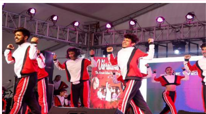
“Tanzmania”-- The Western Dance Competition