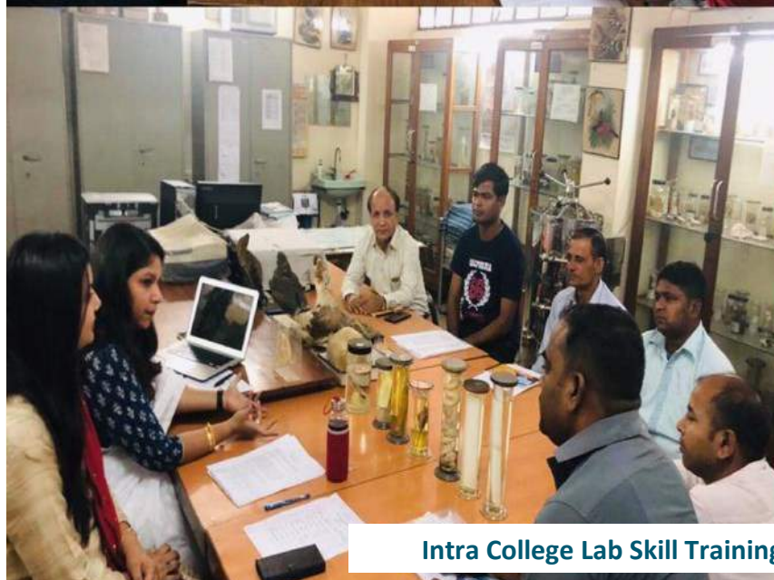
Intra College Lab Skill Training Programme