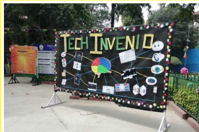
Decorations for Physics Fest