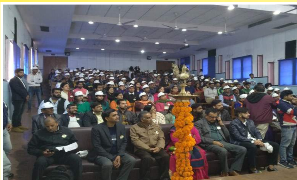
Celebration of National Voter's Day

The National Voters' Day was celebrated by the Department of Political Science, in collaboration with the Election Commission of India, Zonal Office on January 25, 2019 in the college auditorium.