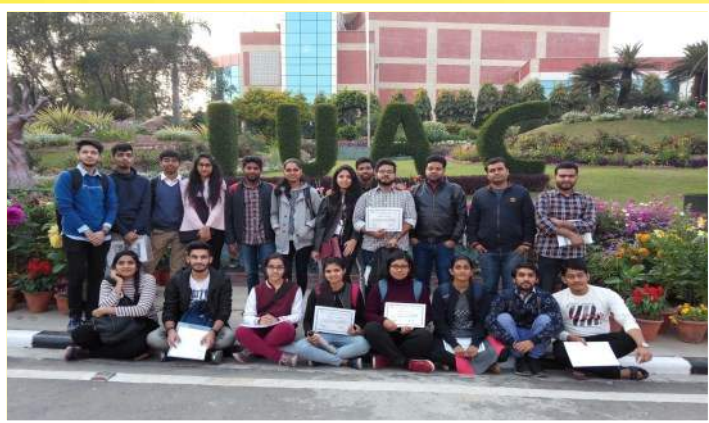
National Science Day Programme at IUAC