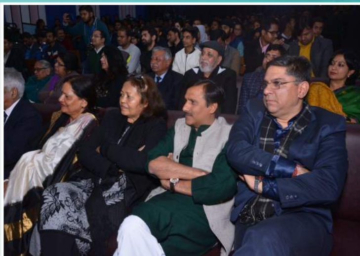
The Audience Entranced by the Music