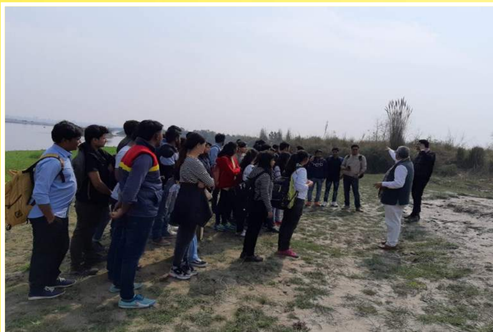
Field Trip to Manaoli Toki Village