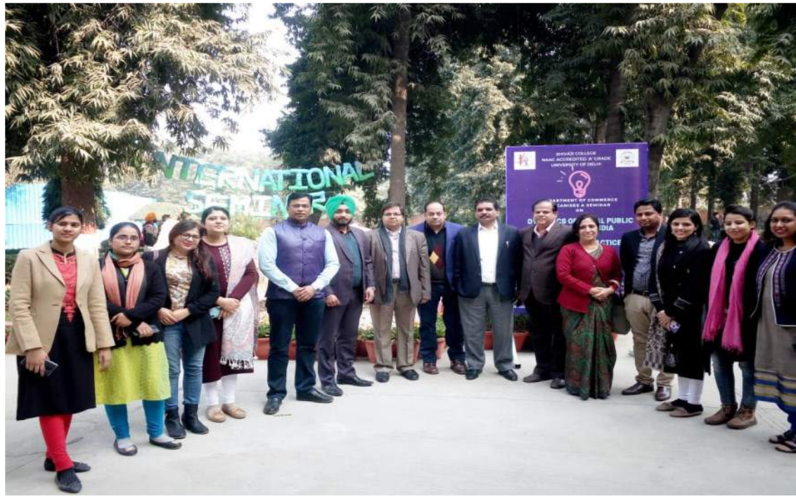
International Seminar : Department of Commerce