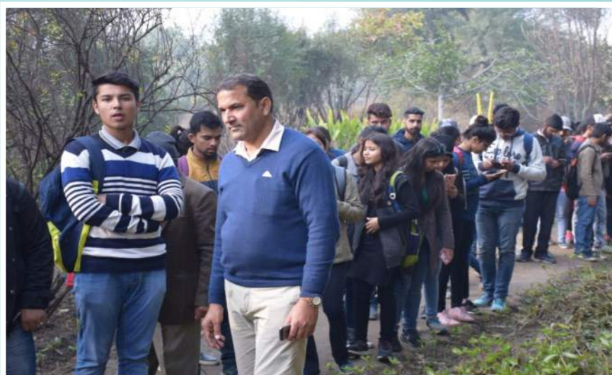
Observing the Greens