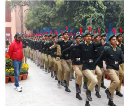
Marching to Make a Better Nation