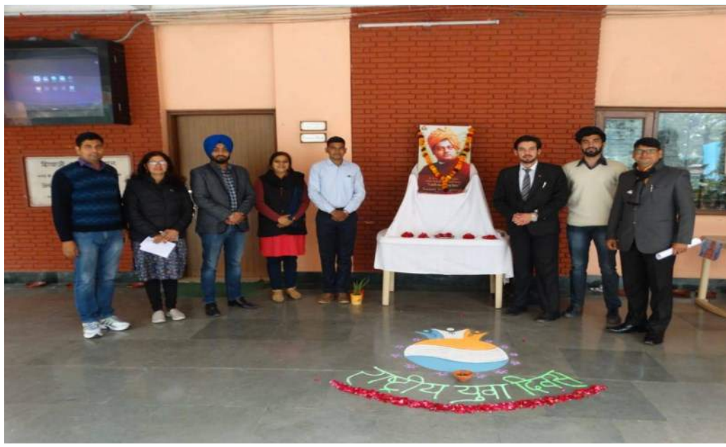
National Youth Day

The MSSSI Delhi planned a mega bike rally on the February 3, 2019, to raise awareness against the crippling disease of Multiple Sclerosis (MS). The rally was flagged off from Netaji Subhash Palace (NSP) at 8:40 AM and culminated at Ansal Plaza, South-Ex at 10:10 AM, where Shivaji College NSS volunteers and NCC Cadets aptly assisted in the arrangements and escorting the vehicles into the shopping complex.